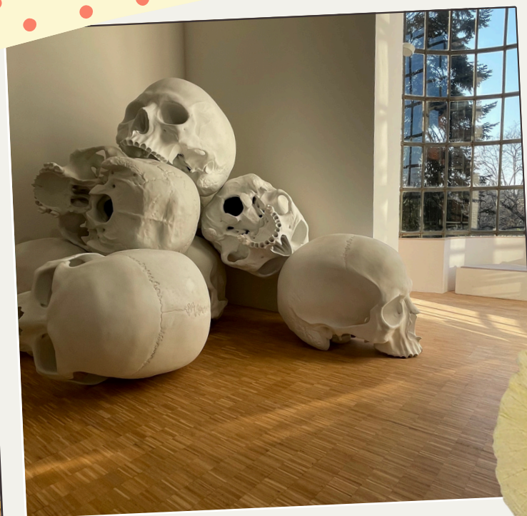
exhibition of Ron Mueck